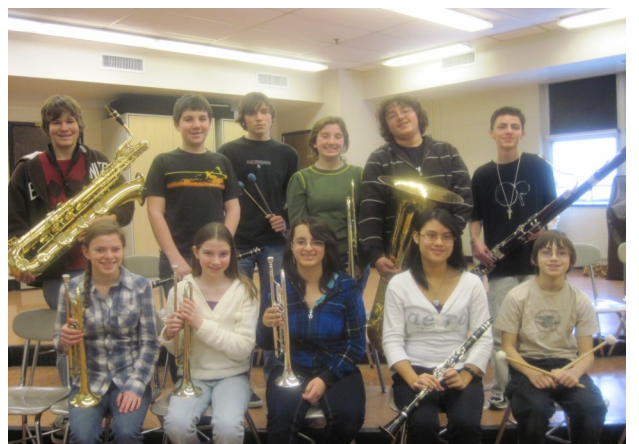
SRMS's All South Jersey Band participants.