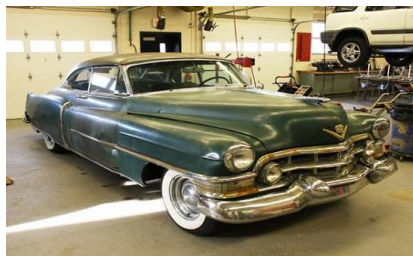
The 1952 Cadillac Series 62 Coupe that will be restored by Auto II and Auto III classes.