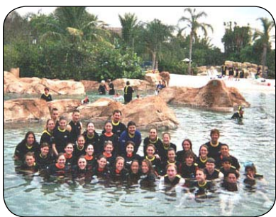
SRHS students on the 2005 Earth Experience trip prepare for a day of snorkeling and swimming with dolphins in Florida's Discovery Cove.

Earth Experience, an educational travel club with an emphasis on hands-on learning, is planning its next self-funded trip for November 29 through December 3, 2006.