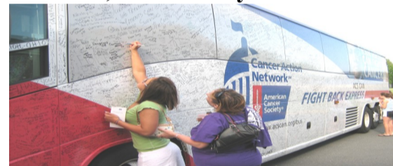
The Fight Back Express Bus received over 500 signatures from participants at the Relay for Life event held on May 30-31st.