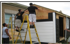
Students learned all aspects of building in the industrial arts elective "Fix Anything!"

At the St. Francis pool, students learn the art of paddling, pushing-up their upper body and pulling their legs into a squatted position on a long-board. Lisiewski is hopes to operate a two day surf camp with the students along the beaches of Ship Bottom this summer.