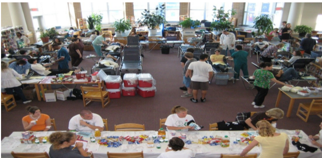
11/12 Library converted into a blood bank center.

The National Honor Society, working with NJ Blood Center, helped transform the 11/12 library and parking lot into a blood drive with students, staff and community members participating. 207 people registered and 175 pints of blood were collected.