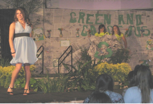
The Fashion Merchandising Class hosted a "Green and Gorgeous" Fashion Show on May 1st. Students modeled garments and accessories from local stores as well as Southern Regional's Cinderella's Closet and Clothing Studio. Ecology tips regarding the environment were presented.