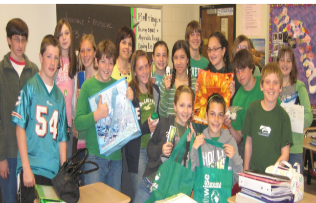
Students in Lori Sefcik Period Two Advanced Science Class recognize Earth Day!

Students in Lori Sefcik's Science class were asked to wear green and bring in an item or a picture of an Earth friendly object to demonstrate how we all can help the environment. Students discussed items and pictures such as hybrid cars, light bulbs, solar panels, reusable grocery bags, water bottles, water conservation, solar calculators and energy efficient appliances. "We are not only saving money, we are saving energy," said Sefcik.