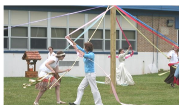
Students dance the Maypole outside of the 9/10 Building.